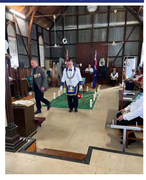
Dep Dist GM just laid a wreath