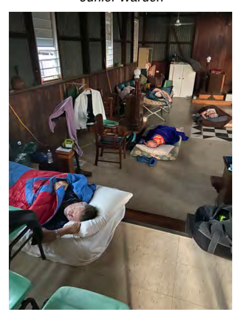
The accommodation is Five Star