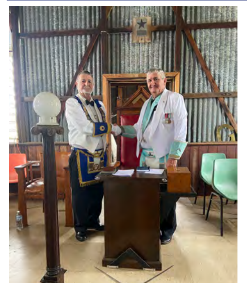
Wor Master and Dep Dist GM