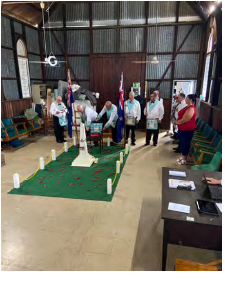
Escort team with Empty Chair