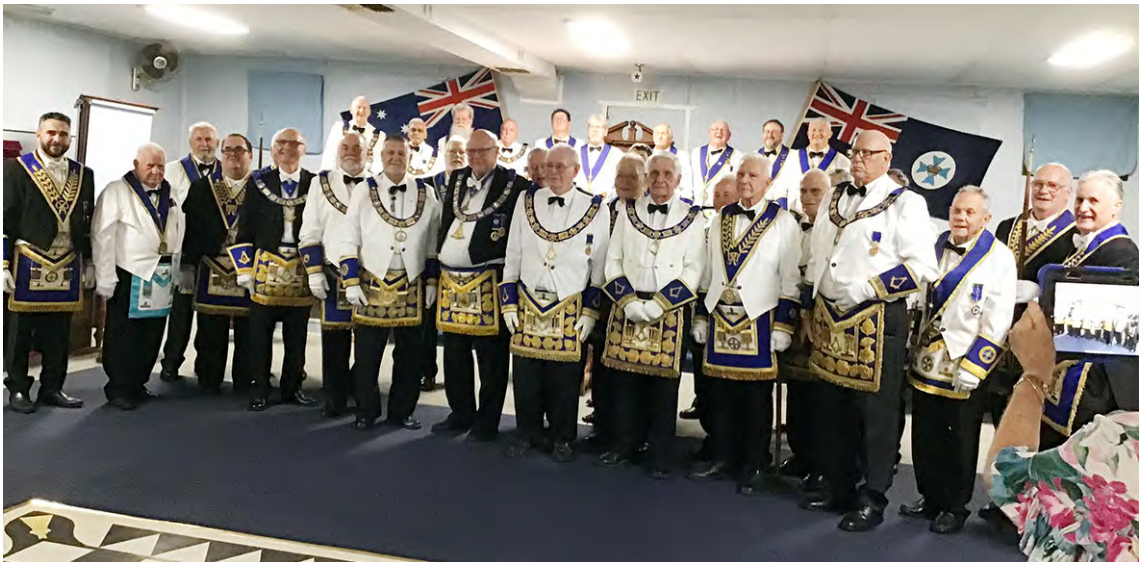
Group after Installation