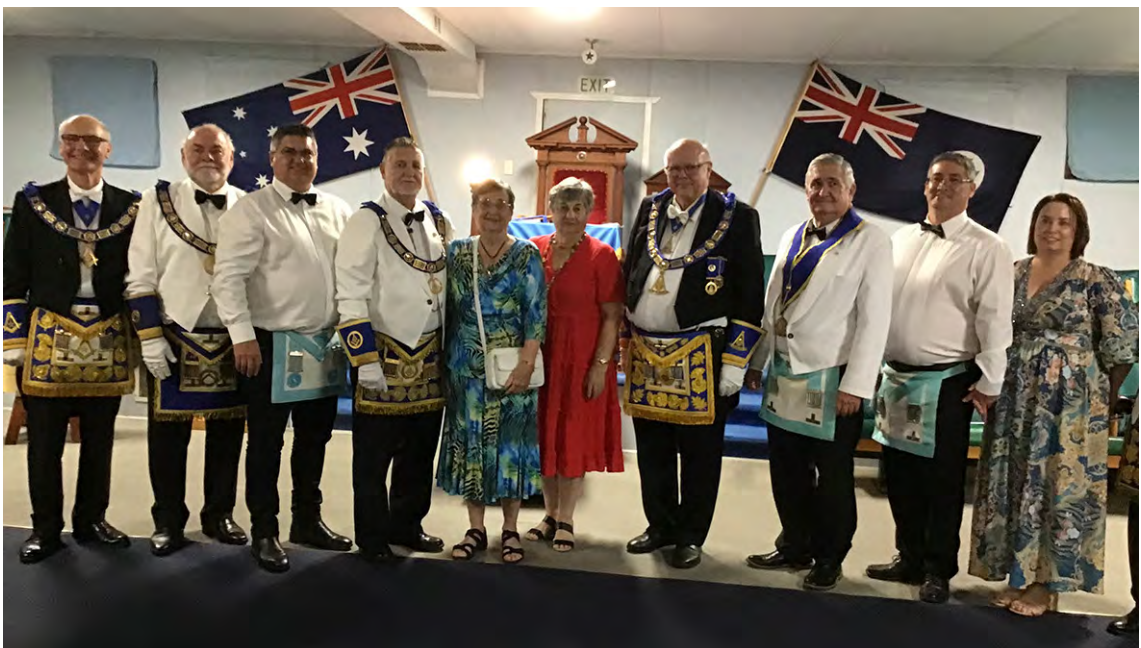
It's all about family