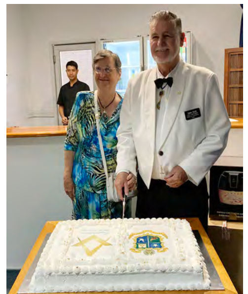
Cutting the cake