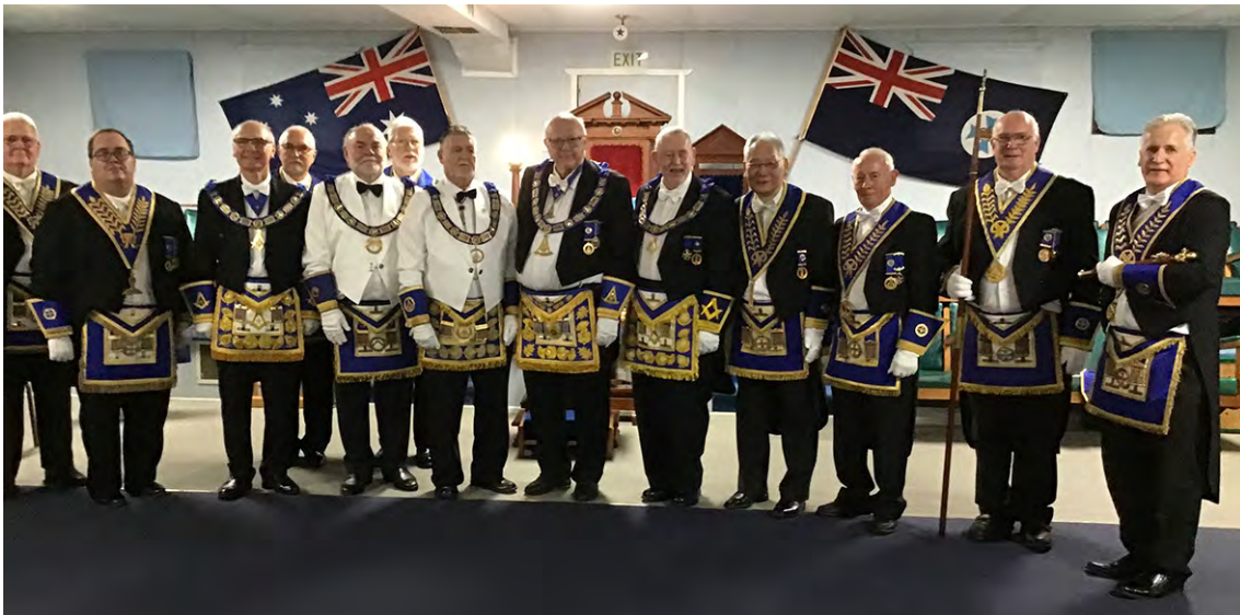
Newly Installed District Grand Master, his Deputy and the Grand Team