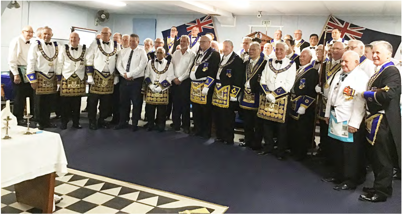
Group photo after Consecration