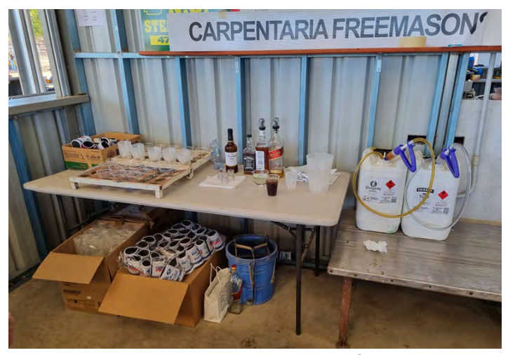
The Gulf Lodge 64 volunteered to man the bar at the 'Forsayth Turnout and Etheridge Show'. Check out the unique rum and vodka dispensing arrangement